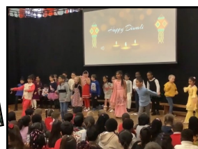
Y2 Diwali Assembly