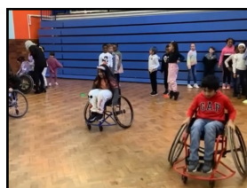
Disability and Antbullying Day