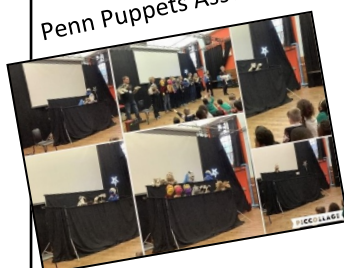
Penn Puppets Assembly