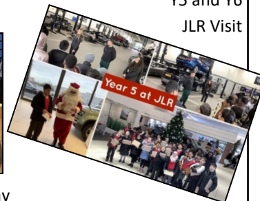
Y5 and Y6 JLR Visit