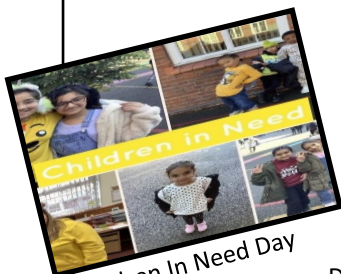
Children In Need Day