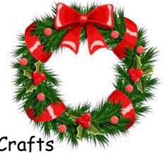
KS1 Christmas Crafts