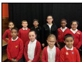
School Council Elections