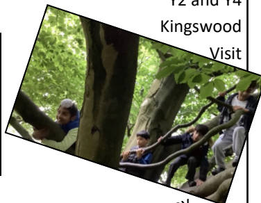
Y2 and Y4 Kingswood Visit