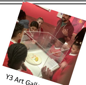
Y3 Art Gallery Visit