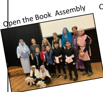
Open the Book Assembly