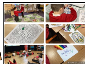
Children's Mental Health Day