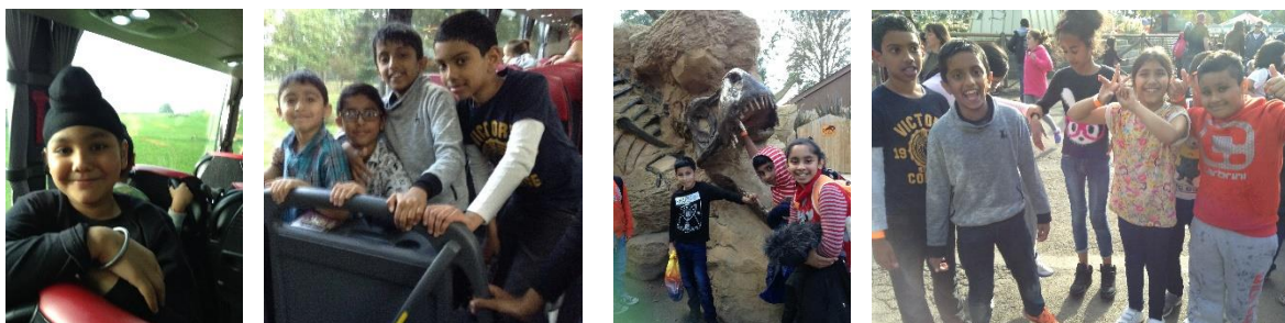
Attendance Winners - Safari Park