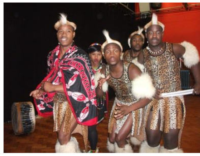
Black History Day

Visits have included Safari Park, Baggeridge Park, Birmingham Airport, Bridgnorth, Birmingham Think Tank, Birmingham China Town, Birmingham Safeside, Chester Zoo, Christmas Tree Farm, Cosford Aero-Space Museum, Cosford Grange, Gelliwig, Hoo Farm, Ironbridge, Kingswood, Kington, Leicester Space Centre, Weston Park, Weston Super Mare, Wildside and many more.