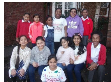
Children In Need Day

The Co-op/ Midcounties support school work and projects.