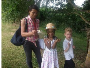
St. Mary's Forest School