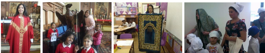
Some of our multi-cultural events

In Religious Education we follow the guidelines that the local authority have produced. The teaching is based on the belief that all faiths and practices should be valued. There is an assembly every day for the whole school, key stage or class. There is also an assembly to celebrate and reward the children for good work. This is important in supporting our ethos of every child achieving its full potential.