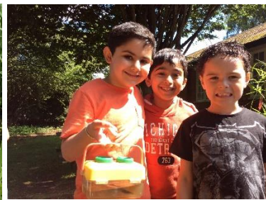
Kingswood Residential Centre